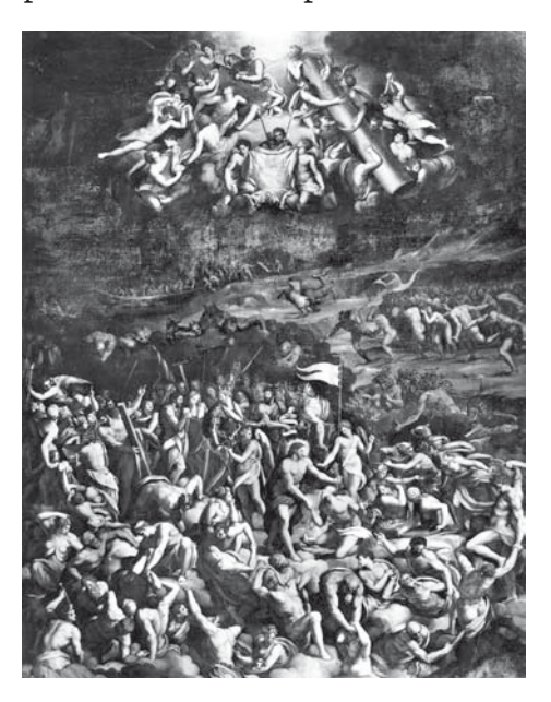
Fig. 2 Alessandro Allori, Harrowing of Hell, 1572–1578, oil painting on wood, 1.65 × 1.27 m, Rome, Galleria Colonna.

Significantly, previous studies published thus far have been silent about the origins of this extraordinary textile figure. On the one hand, the appearance of an autonomous bloodstained cloth as a carrier of presence can be interpreted in terms of artistic practice. The numer-