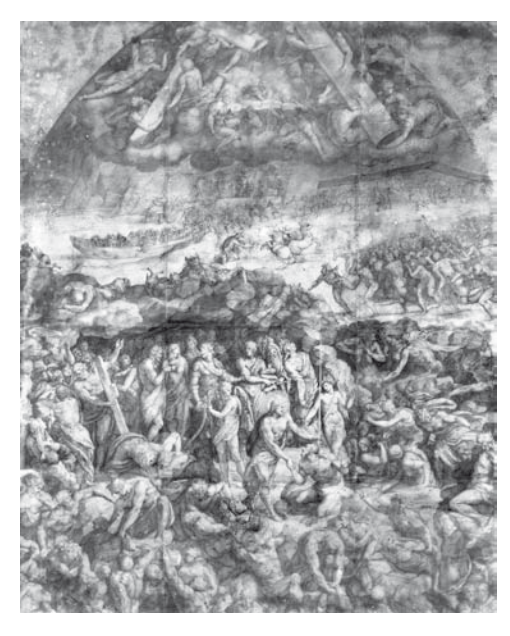
Fig. 1 Alessandro Allori, Harrowing of Hell, 1572–1578, pencil drawing, 1.52 × 1.26 m, Florence, Galleria degli Uffizi, Gabinetto dei Disegni e delle Stampe, inv. 1787E.

stantial compositional modification: instead of the figure of Christ – known from Michelangelo's model and hence expected by the viewer –, a cup held by angels and a banderole with an abbreviated quotation from the Book of Zacharias 9,11 appears here: «in sanguine eduxisti vi[n]ctos», typologically referring to the Eucharist. The Savior's bodily presence was marked in the lower part of the composition