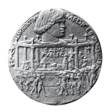
Fig. 5 Bertoldo di Giovanni, Medal commemorating the Pazzi Conspiracy and the Assassination of the Medici, 1478, obverse and reverse, ø 6.6 cm.

it directly implies an element of prospective commemoration, as the most important moment of the transformation of the Christian ritual: the transition from tristia to gaudium within sacramental procedures that culminate in the final stage of Eucharistic transfiguration is evoked. The persistent dimension of the sacrifice was here combined with the socialization of Medici power, represented on the medal quite literally by means of the authority motif in the form of the head ( caput ) controlling the members of the body equated with the State. The persistent dimension of the body equated with the State.