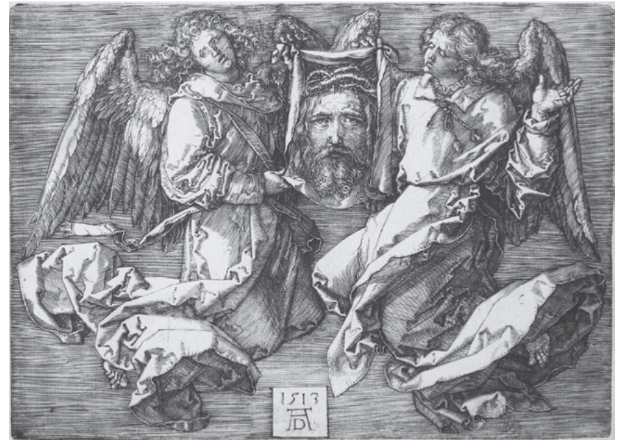
4 Angels with the Cloth of Veronica, 1513, engraving, SMPK Berlin