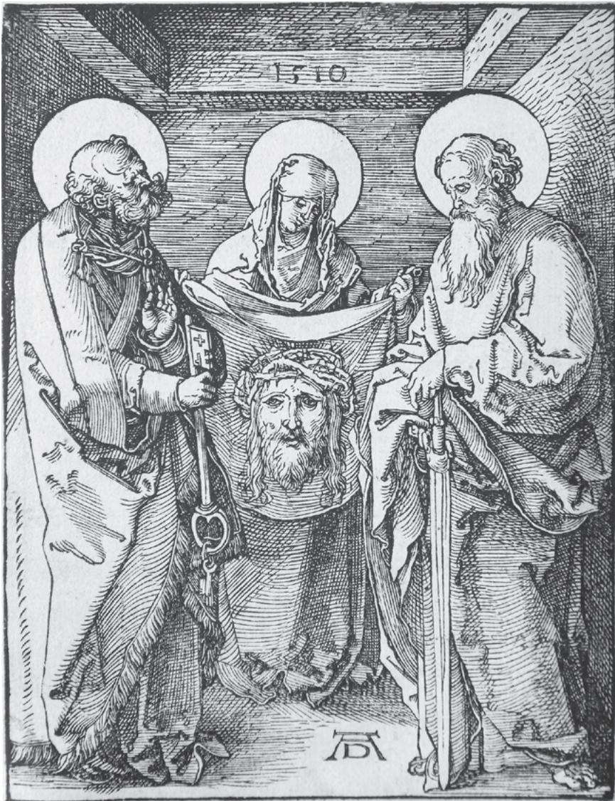
3 Veronica with the Apostles Peter and Paul (from the Small Pasion), 1510, woodcut, SMPK Berlin