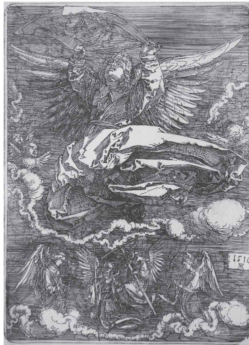
5 Angel with the Cloth of Veronica, 1516, etching, SMPK Berlin

This observation leads us to the matter of the veil’s pictorial weightlessness. The liberation of the cloth with the sancta facies from the laws of statics and gravity comes with the third of Dürer’s Veronicas , an enigmatic etching made in 1516 (fig. 5). 12 The question concerning this composition had been the following: is the angel pulling the Veronica’s veil downwards; or does the wind blow so hard that we see the veil billowed and turned upside down as well as his garments bulging from below? 13 I believe it is both. If one takes another element of dynamics into consideration, namely the wings of the central angel holding the cloth, it will be clear that what we see here is the brief moment of suspension during a quick flight or even descent which provokes air resistance. The angel’s wings are stretched out to the maximum exactly like the wings of a bird about to land such that it must lose speed and stabilize at the very last moment. The difference to other angels that are included in this composition as well as to other depictions of birds or angels by Dürer confirms this extraordinary effect of the suddenness of apparition. In the case of this angel we can even speak of something we could call the load factor: there is a sudden moment of arresting the quickly descending movement while still in the air. This “pull-up action” causes an instantaneous loss of gravity due to the contradiction of forces and the flying body’s weight. Such a “load factor,” however, does not