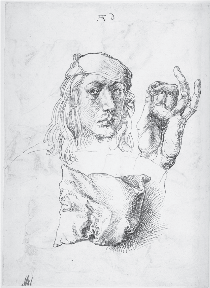
2 Albrecht Dürer, Self-portrait with hand and pillow, 1493, drawing, New York, Metropolitan Museum of Art

pillows in terms of a “double mimesis.” 4 Such an approach resembles the early modern artistic practice of living anthropomorphic landscapes by Arcimboldo, Merian, de Momper and others. This tendency could be a symptom of our capacity for visual recognition: according to these premises, we need portrait-like presentations of people, things, interiors, and landscapes to locate them in our already multilayered systems of representation. 5 To see faces in Dürer’s pillows means to apply the Renaissance idea of natura naturans onto depictions. In this view, representations should reflect upon their own subjectivity, telling us more than we actually expect or are able to see at first glance. Otherwise we see just pillows. But isn’t it just about seeing pillows, which do not have any form other than a physically relational one, strictly dependent upon the object’s own gravity?